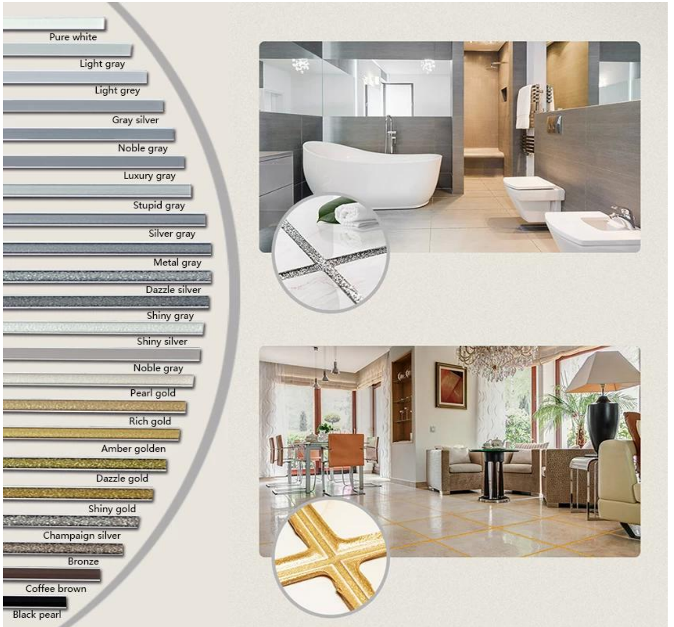
Samar da cikakkiyar hanyar daki