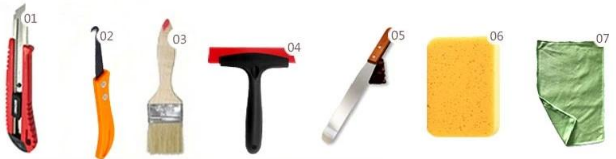
Cutter Knife | Pointing trowel | Brush | Rainbow Scraper | Stirring Knife | The sponge | Scouring Pad