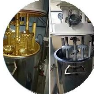
Bayanin sarrafa batutuwa