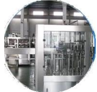
Sanyi mai sanyaya