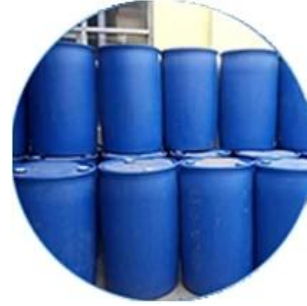
Kayan Kayan Kayan Gaskiya