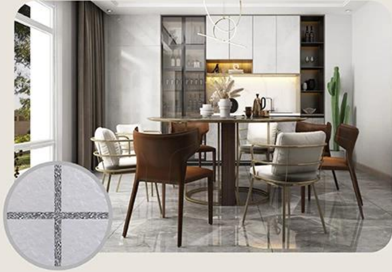
Bayar da Maganin Tazarar Duka Gabafaya