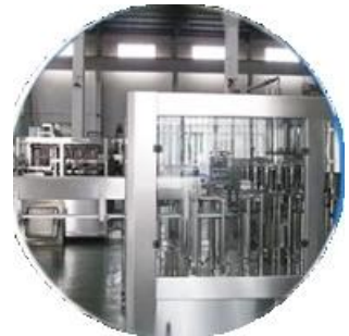
Sanyi mai sanyaya