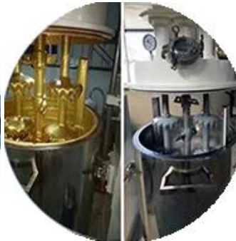
Bayanin sarrafa batutuwa