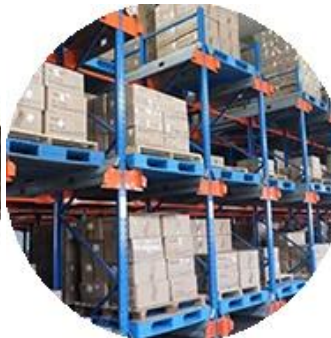
Kayan Kayan Kayan Kayan Gaskiya