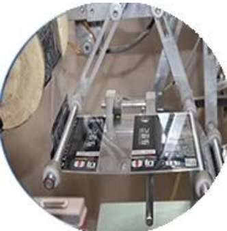
Mashin mai rufi