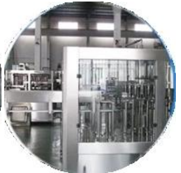
Sanyi mai sanyaya