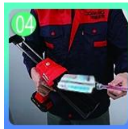
Dunkule a kan bututun karfe, sa a kan babbar bindiga.